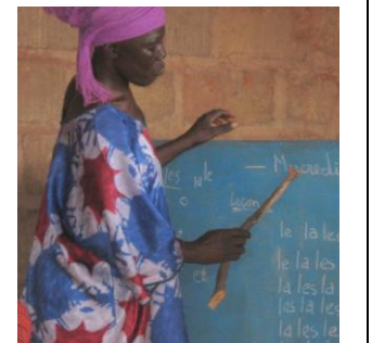
A student in the new literacy class!