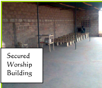
Secured Worship Building