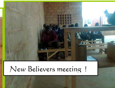
New Believers meeting !