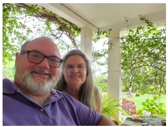
Enjoying being on our veranda once again!

With national elections taking place in Côte d'Ivoire in late October, we need to get as much done as possible before that as we may need to limit travel around election time when the political climate tends to heat up along with the weather!