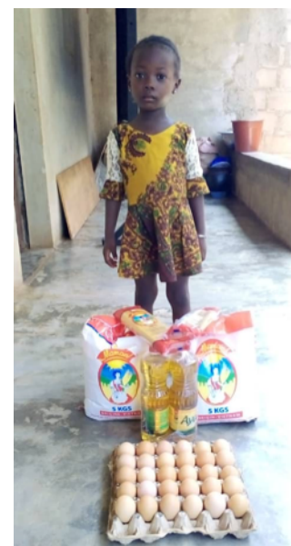
Above: A sponsored child in Korhogo receives food through Children of Promise during the May distribution.

During this period of social distancing and the inability to gather in person, we have been especially grateful for the ongoing outreach of Christians Broadcasting Hope radio, which produces the French radio program Tribune Jeune in Côte d'Ivoire. Praise the Lord for the ways in which He works even in the midst of difficulty!