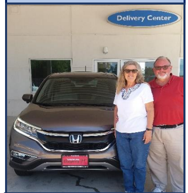
Purchasing our 1 st car in the USA!

Since we have been in the USA for the past five months and are far from our veranda in Yamoussoukro, our View from the Veranda is more like a View from our Vehicle, or some other mode of transport. Upon our arrival in the USA in June, we purchased our first personal car in the States in 34 years of marriage. And since then have put 17,500 miles on it, traveling in 31 states. In addition to driving across the country, we have also traveled to some places by plane, ship, train and bus. The views from our vehicle have been varied and vast-from the desert-scapes of Nevada to the breathtaking cliffs of the Oregon Coast. From the wheat-covered plains of Kansas to the glacier-covered mountains of coastal Alaska, we have found no lack of marvelous views to captivate our attention as we drive across the USA.