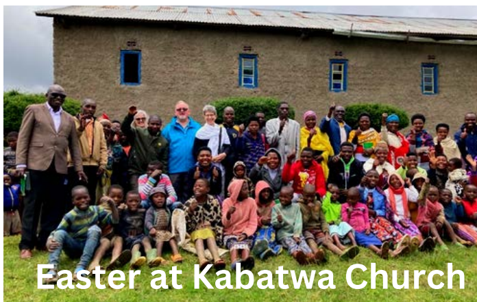
Easter at Kabatwa Church